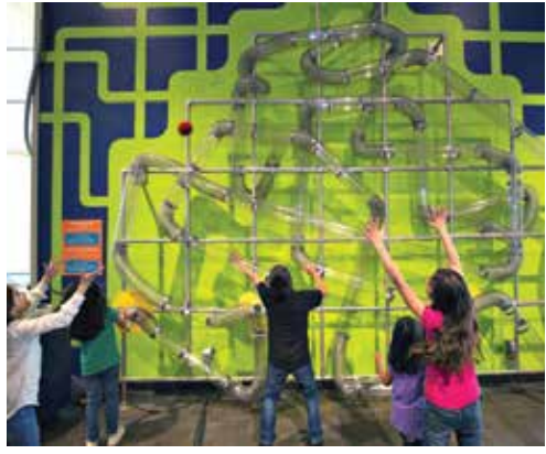
Hands-on experiences are what the Burlington Steam Zone is all about.

As a scientist or a technologist, children will be challenged to put tubes and ramps together on the wall, and make a maze to get their ball to the Burlington Canal Lighthouse. If it doesn't work the first time,