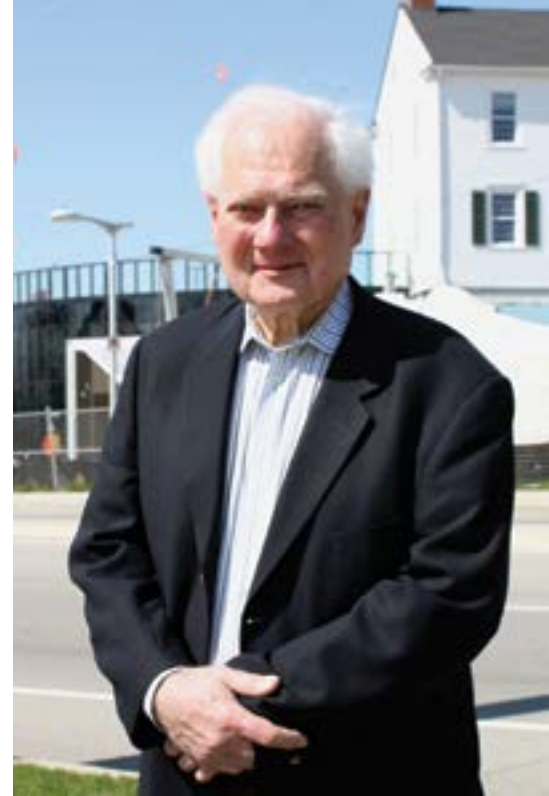
Former Burlington Mayor Walter Mulkewich stops by to see the progress on the Joseph Brant Museum expansion project. The museum is expected to re-open this summer.

Walter notes the project is also important to enhancing the City of Burlington's image as a significant historical place. "We don't do enough to preserve our history, so this is important for Burlington.