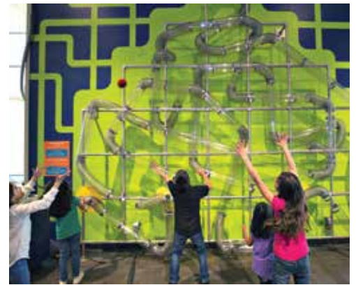
Hands-on experiences are what the Burlington Steam Zone is all about.

As a scientist or a technologist, children will be challenged to put tubes and ramps together on the wall, and make a maze to get their ball to the Burlington Canal Lighthouse. If it doesn't work the first time,